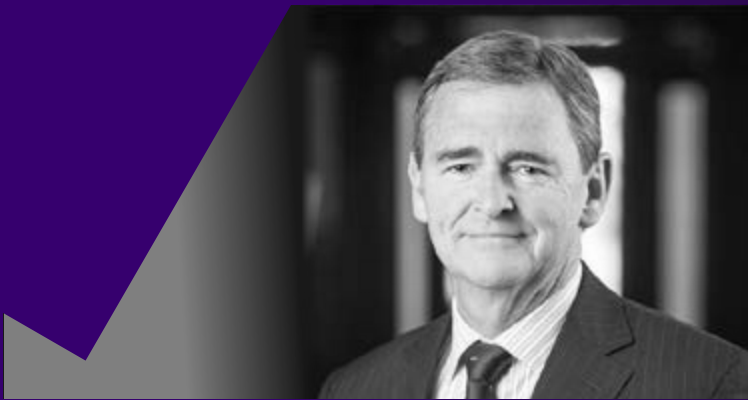
The Hon John Brumby AO, Chair

Whether it's the next generation of medical tech, designing sustainable food sources, or uncovering new ways to take action on climate change, Victorian innovators are already developing the research, technology and ideas that will transform our lives for the better.